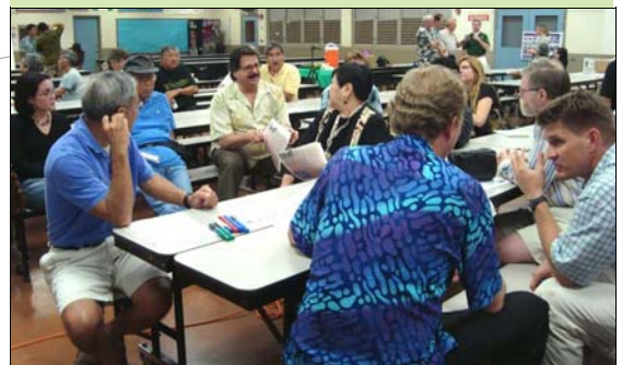
Community Workshop 2 - December 1